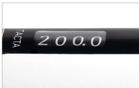
The volume is easy to read even when the pipette is angled.